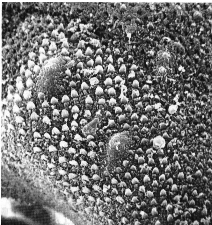
Fig. 4. Oral sucker of Cymatocarpus solearis showing sensorial papillae. 2000X (SEM).

papillae, besides the tegumentary ones, were also observed in the surrounding area of the oral sucker (Fig. 4).