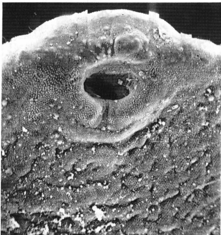
Fig. 3. Oral sucker of Cymatocarpus solearis showing the tegumentary papillae. 320X (SEM).

The SEM photographs made possible to observe the presence of spines all over the body, denser anteriorly. The oral sucker showed spines and numerous tegumentary papillae with apparently no arrangement on the anterior lip; papillae were also present on the posterior lip, but less numerous (Fig.3). Sensorial